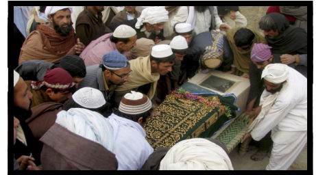
Funeral of drone victim in Pakistan

Responding to the critics of his Austrian invasion, Hitler said, "Certain foreign newspapers have said that we fell on Austria with brutal methods. I have in the course of my political struggle won much love from my people. Not as tyrants have we come, but as liberators." The déjà vu is all prevailing, the similarities to the perpetual American war on terror too great to be ignored. Today, those whom Washington sets out to liberate have no difficulty in deciding whether their forced benefactors are tyrants or liberators.