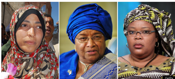
Ellen Johnson Sirleaf, Leymah Gbowee, and Tawakkul Karman

that night gathered outside the jail in richmond we were listening in our cars to that program about troy davis troy davis another brother about to be murdered another brother with the hope of the poor which dries out in the sun of the morning and grows sad during the dawn hours we were waiting for a miracle but it was time to pray, walking for our own, my sisters and my brothers waiting for the hour of deportation victims of greed, of racist hatred that knows nothing of brotherhood, sisterhood so that at first we directed a prayer to the heavens, to the sunny afternoon, to the universe in solidarity with that brother who languished in a southern prison later we found out that in the hour of the californian dinner, or rather the cuban californian dinner, at that time when we sat down at the table or shook the hand of the friend in the restaurant they were murdering troy davis another huge pool of blood over our hands and i am troy davis and you and he and that one and the one in the corner we all in the struggle in california new york, arizona and shit alabama, occupying wall street and the bart stations in the bay, and so many people piled up on the sidewalks, in the stadiums, in the stations of the police... i am, you are, he and she, we, all of you, each and every one worlds everlasting troy davis